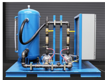
COMPLETE PUMP SKID