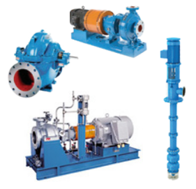
Centrifugal • ANSI • Slurry • Sump • Submersible • Split Case • Vertical Turbine • Mag-Drive • Energy Process